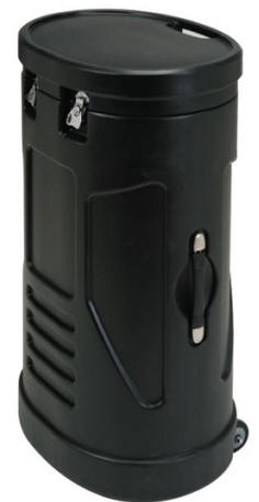
Hard Shipping Case with Wheels