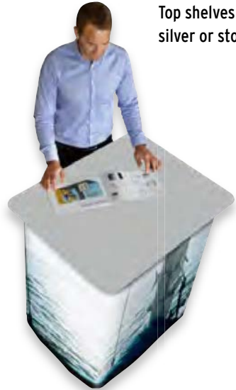
Top shelves available in silver or stone.