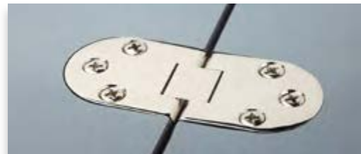
Professional finish on all details.