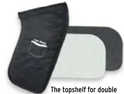
The topshelf for double Case & Counter is available in silver.