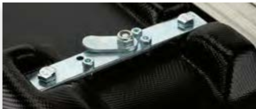
The top shelf is easily secured.