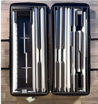
CA800 Hard Case Opened Showing Form Inserts