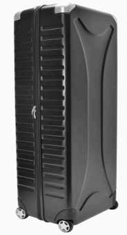
CA800 Hard Case

Hardware converts for use in 10x10 booth space and additional graphic panels.