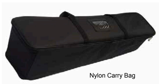
Nylon Carry Bag