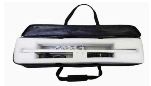
Inside Nylon Carry Bag