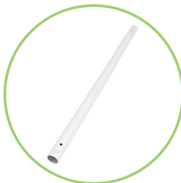
QTY 2: 24" Tubes