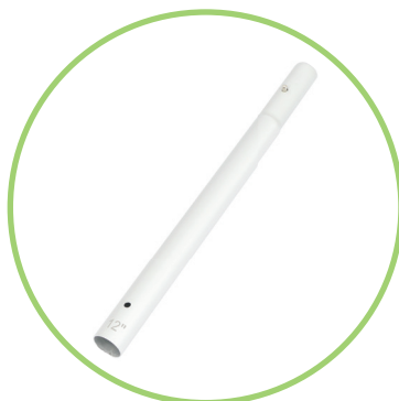
QTY 6: 12" Tubes