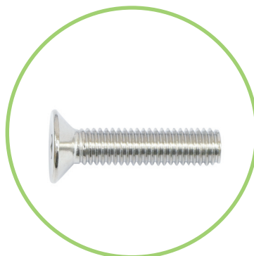
QTY 2: Steel Base Screws