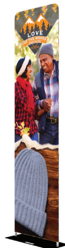
Double-Sided Back View