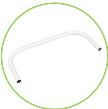
QTY 1: 24" Top Tube