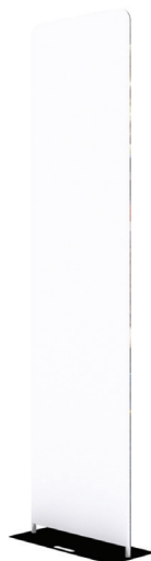
Single-Sided Back View