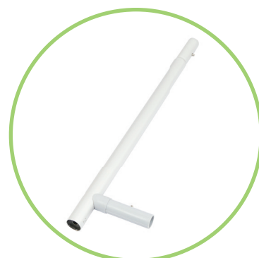
QTY 2: 20" Bottom Tubes