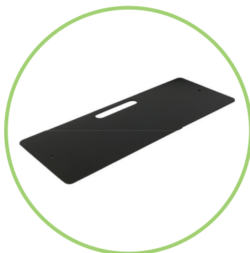
QTY 1: Steel Base