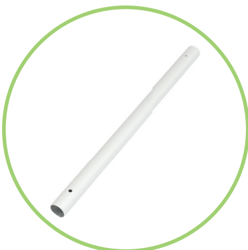
QTY 1: Horizontal Bottom Tube