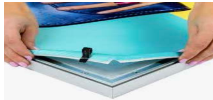
SEG One Planet Vibrant Fabric Graphics