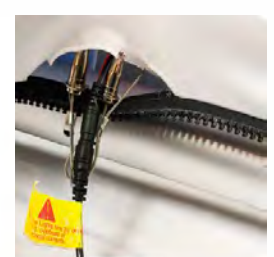
Connect Each Lighting Curtain to Power Supply