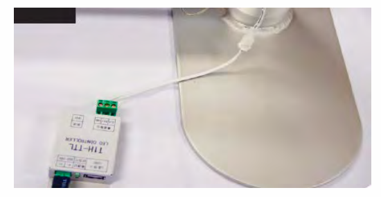
Connect Controller to Lighting Curtain

Included on the righthand side of this PDF page you should see (4) attachments that are downloadable for continuing information for product choices. If not click on the paper clip attachment drawing. If you still can't see them please request from your Indy Displays sales personnel and they will send directly to you.