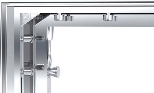
Attachment Hardware Shown Above