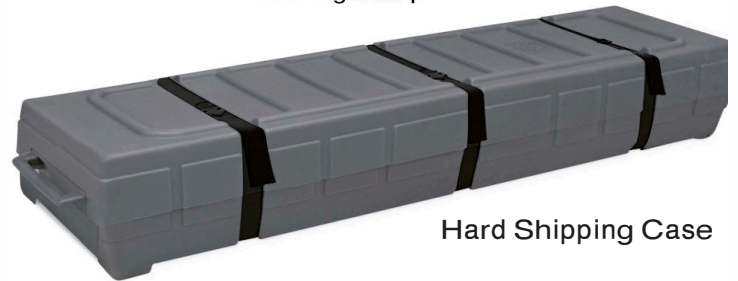
Hard Shipping Case

Shipping Case Weight & Display: 155 lbs each Set Up Instructions: See Attachment