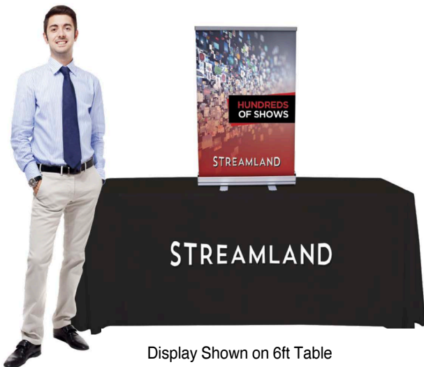
Display Shown on 6ft Table

Watch YouTube of Set Up: https://youtu.be/Gr11fgDLjRo