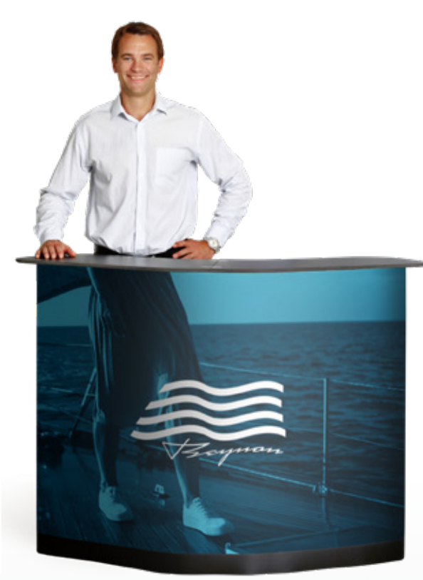
Cost for Single Case Counter & Top: $1545 Cost for Graphic Wrap: $345